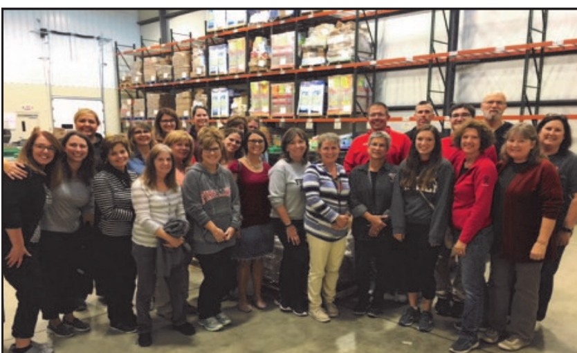
Volunteers from Firelands Local School help at Second Harvest Food Bank.