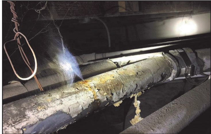
Image of a cracked hot water line at SAMS