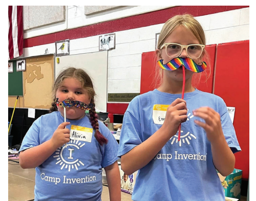
Future Hall of Famers at Camp Invention, Summer 2023