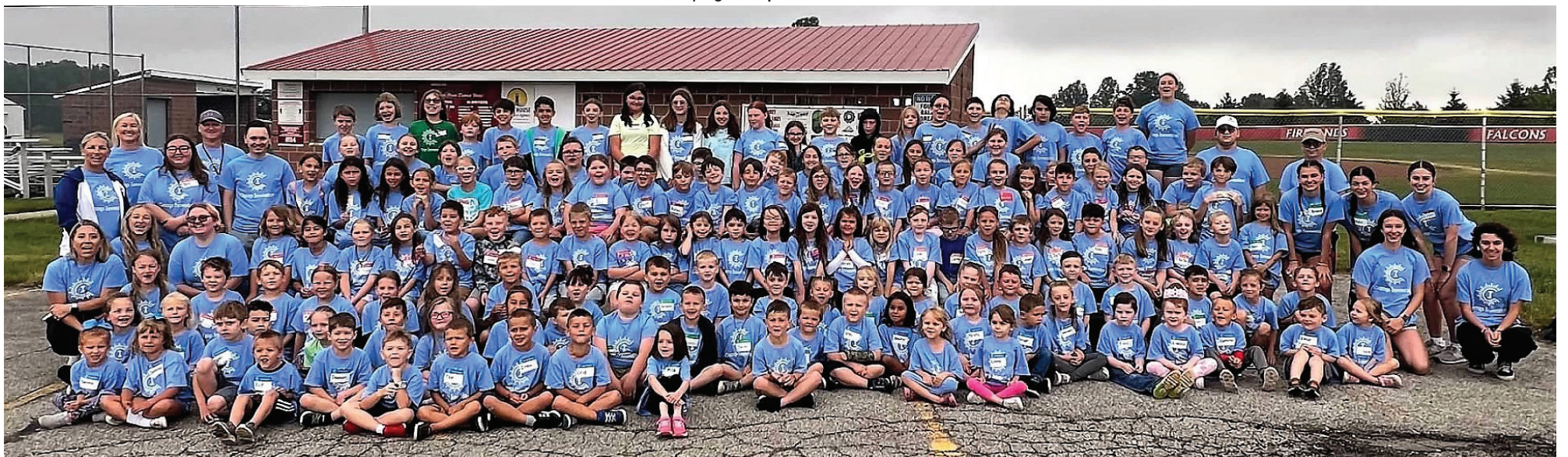
Camp Invention had a record turnout this summer! Please enjoy more photos from summer school and Camp Invention throughout this issue.

You may view this issue online at: www.firelandsschools.org