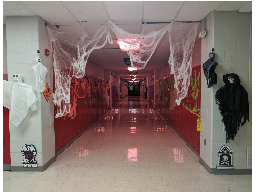
Firelands High School hallways are ready for Halloween!